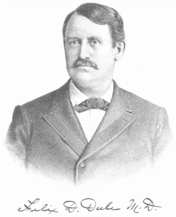
AUGUSTA, WOODRUFF COUNTY, ARKANSAS.